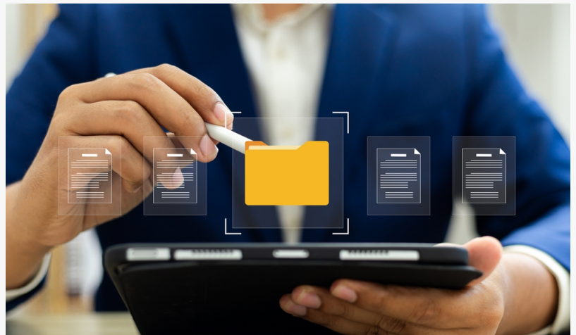
Secure Document Storage and Disposal Services