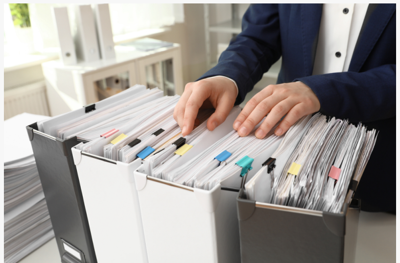
archive document storage los Angeles,