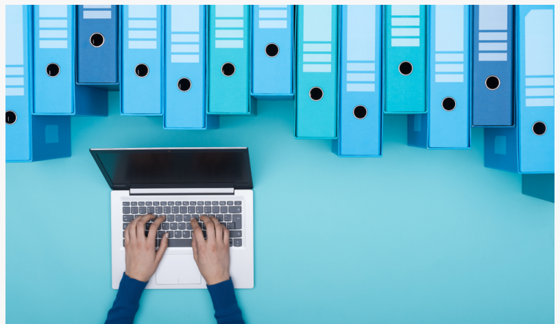
archive document storage

Services Provided by Williams Data Management