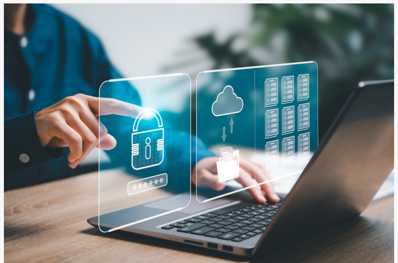
Secure Document Storage

Williams Data Management focuses on compliance with data security regulations, a growing concern for businesses in Los Angeles and across California. Laws such as the California Consumer Privacy Act (CCPA) and the Health Insurance Portability and Accountability Act (HIPAA) require organizations to safeguard confidential information and ensure its safe disposal when no longer needed. Williams Data Management assists its clients in adhering to these legal requirements by maintaining secure environments for storage and offering professional document destruction services.