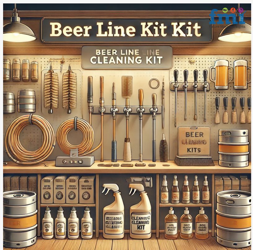
Beer Line Cleaning Kit Market

Beer line cleaning kits have become indispensable tools for breweries, bars, and taprooms across the globe. These kits, designed to remove sediment build-up and bacterial growth in beer lines, play a crucial role in ensuring beverage flavor and safety. With increasing awareness of beer line cleanliness, the industry is witnessing widespread adoption among microbreweries and large-scale commercial establishments alike.