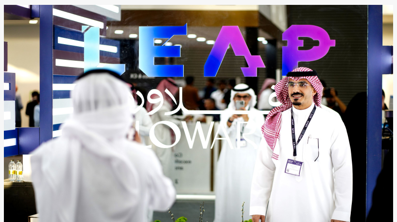
LEAP 2025 Set to Take Place 9-12 February