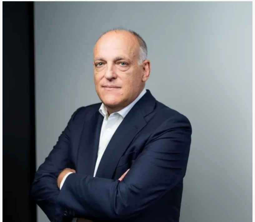
Javier Tebas, President of LALIGA