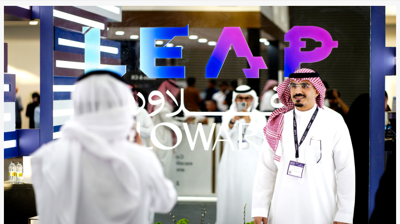
LEAP 2025 Set to Take Place 9-12 February