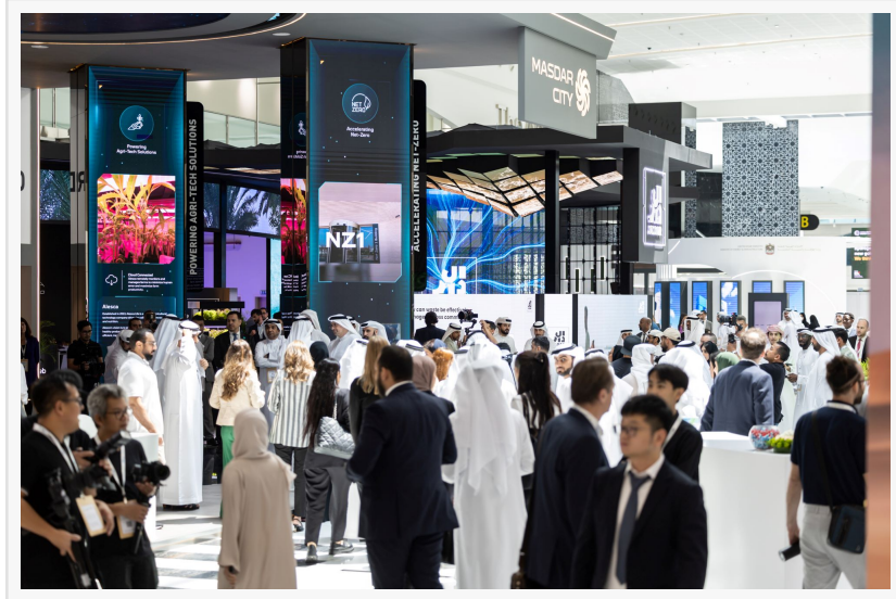
World Future Energy Summit 2025, the foremost regional event advancing clean energy and sustainability, will open tomorrow at the ADNEC

This year's agenda places a strong emphasis on the transformative potential of AI, with sessions exploring its potential in enhancing efficiencies, supply security, and reducing emissions across energy, climate-induced challenges, water and waste