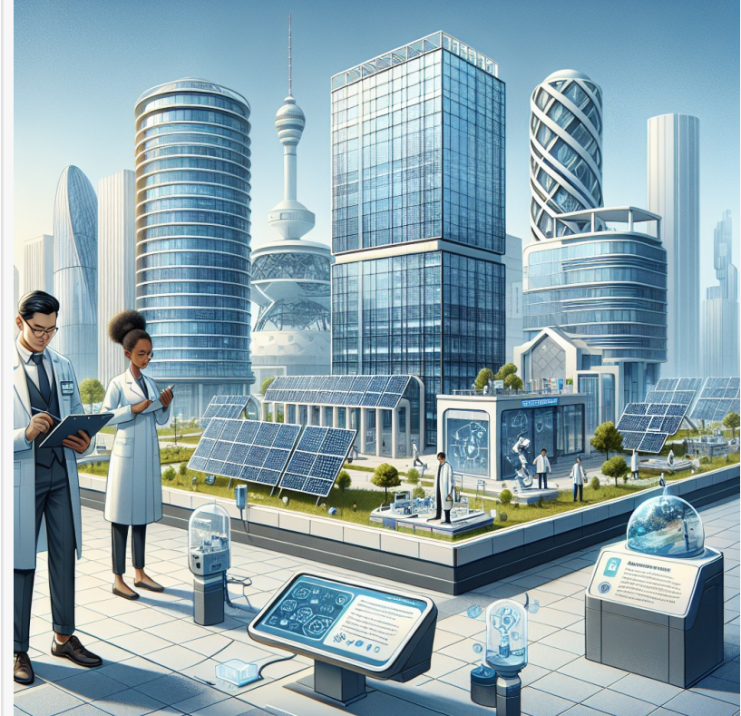
Wildfire IAQ Health Issues

Protecting these vulnerable groups is vital, especially during periods of poor air quality.