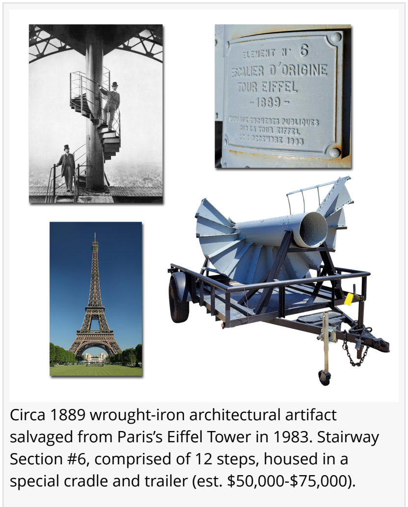
Circa 1889 wrought-iron architectural artifact salvaged from Paris's Eiffel Tower in 1983. Stairway Section #6, comprised of 12 steps, housed in a special cradle and trailer (est. $50,000-$75,000).

The group represents over 30 international Modern artists, including Pablo Picasso (3), Salvador