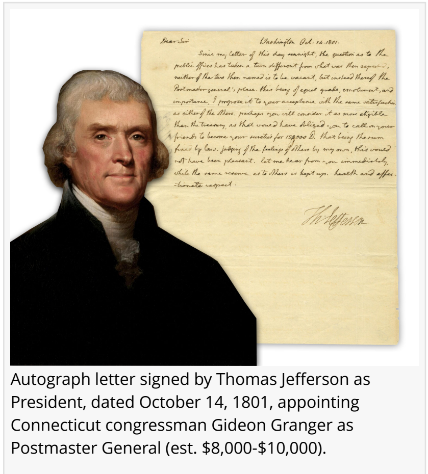
Autograph letter signed by Thomas Jefferson as President, dated October 14, 1801, appointing Connecticut congressman Gideon Granger as Postmaster General (est. $8,000-$10,000).

WILTON, CT, UNITED STATES, January 13, 2025 /EINPresswire.com/ -- A wrought-iron architectural artifact salvaged in 1983 from the Eiffel Tower in Paris; Bob Dylan 's signed and handwritten lyrics to the timeless 1963 anthem Blowing in the Wind ; and an autograph letter signed by Thomas Jefferson as President from 1801 are just a few of the expected highlights in University Archives' online-only Rare Autographs, Manuscripts, Books & Memorabilia auction scheduled for Wednesday, January 29th, at 10am Eastern time.