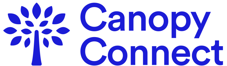
Canopy Connect logo

Canopy Connect is Integrated with Encompass® by ICE Mortgage Technology®