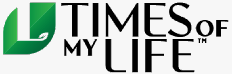
Times of My Life Virtual Biographer

In recent years, catastrophic natural disasters such as the LA Wildfires, Hurricanes Milton and Helene, devastating floods, tornadoes, and earthquakes have reshaped lives and communities. The Times of My Life Virtual Biographer captures these stories to serve as a testament to the