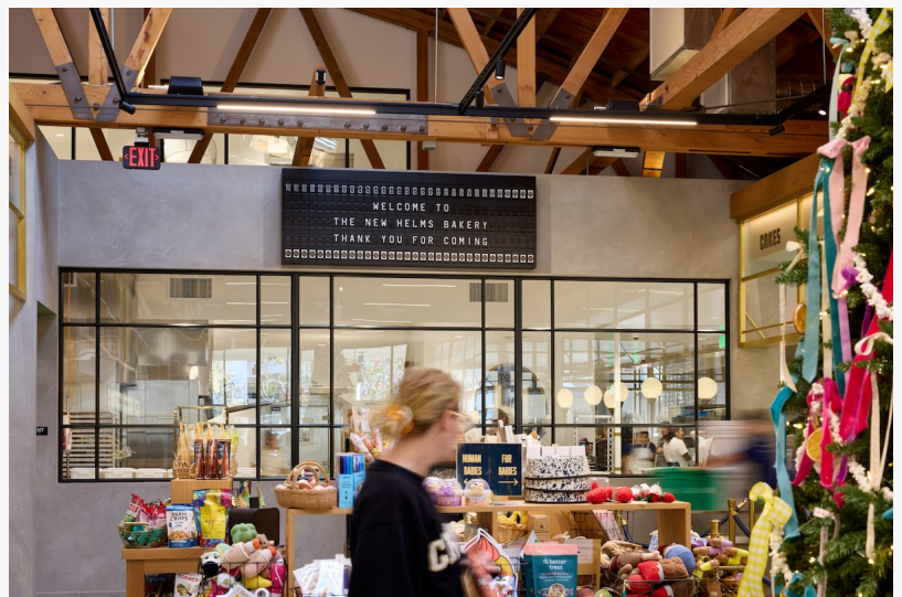
Oat Foundry Split Flap Display at Helms Bakery

LOS ANGELES, CA, UNITED STATES, January 20, 2025 /EINPresswire.com/ -- After decades of anticipation, the historic Helms Bakery has reopened in Culver City, ushering in a new era of delicious food. While its iconic baked goods take center stage, a standout feature of the revived bakery is its Split Flap display, designed and built by Philadelphia-based firm Oat Foundry .