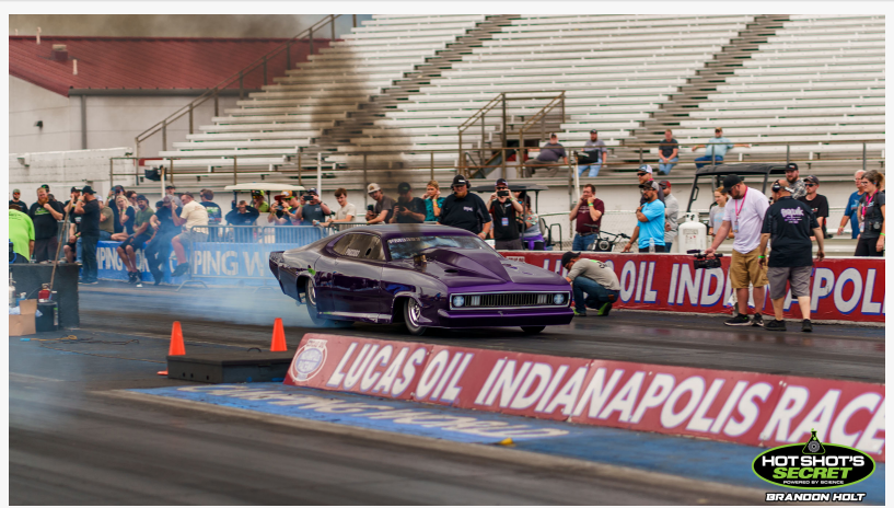
Firepunk Diesel holds record for quickest and fastest diesel Pro Mod.