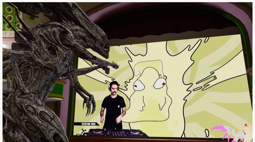
A DJ hologram performs live at the virtual edition of SXSW