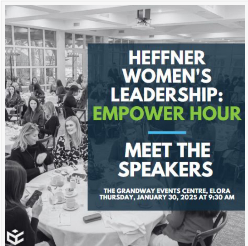
Heffner Women's Leadership Empower Hour Event Details