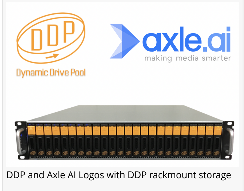
DDP and Axle AI Logos with DDP rackmount storage