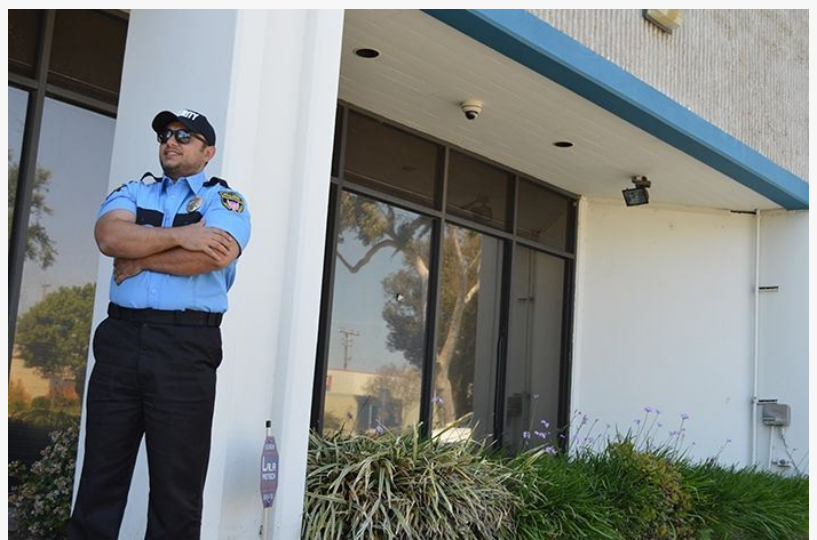
unarmed security guard service-

Hospitals are busy and sometimes stressful places. They are full of patients, visitors, and staff, all of whom need to feel safe and comfortable. But with so many people coming and going, it can be hard to keep track of everything. That's where security guards play a key role.