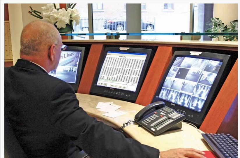
security guard services california

In today's world, safety is more important than ever. With the increasing concerns about crime and emergencies, the role of security guards has become essential. These dedicated professionals help prevent problems like theft, vandalism, and even more dangerous situations such as violence or accidents. Security guards are highly trained to respond quickly to any threat and make sure that everyone stays safe and secure. Their presence alone can make a huge difference. When people see security guards on duty, they tend to feel safer, knowing that someone is looking out for their well-being. This sense of security can prevent trouble, discourage criminal activity, and