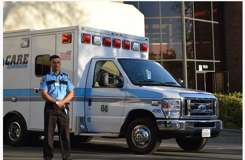
hospital security guard