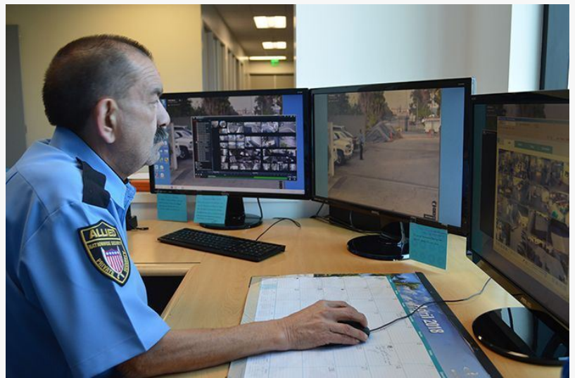
shopping center security guards