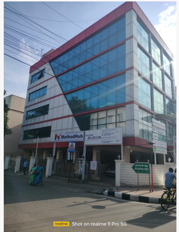
MethodHub Chennai Center