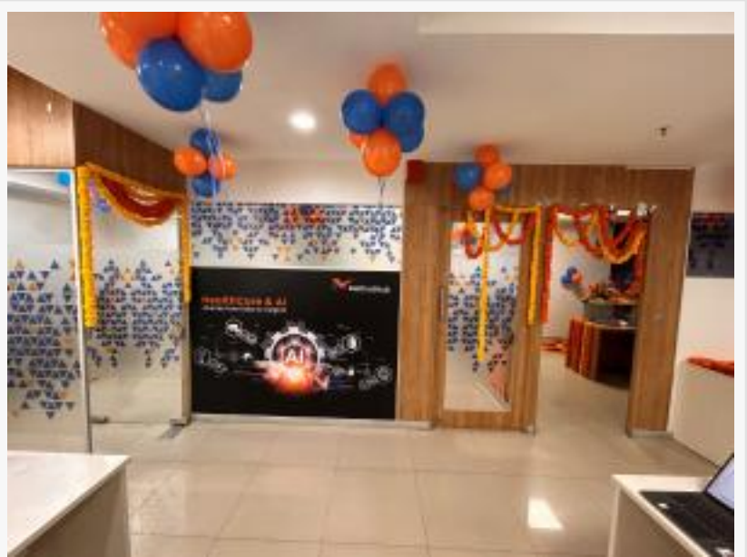
MethodHub Hyderabad Center