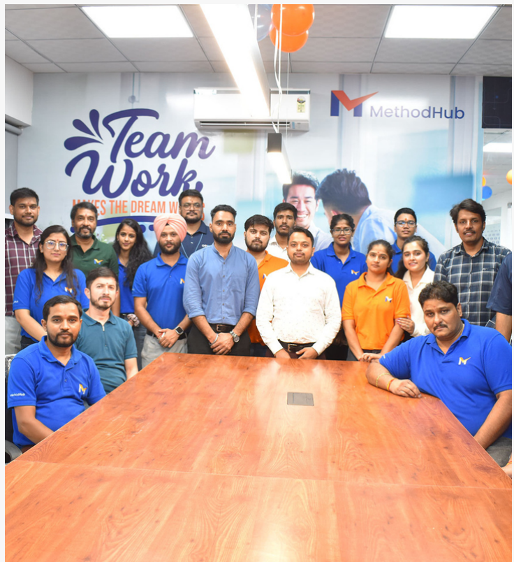
MethodHub Mohali Center