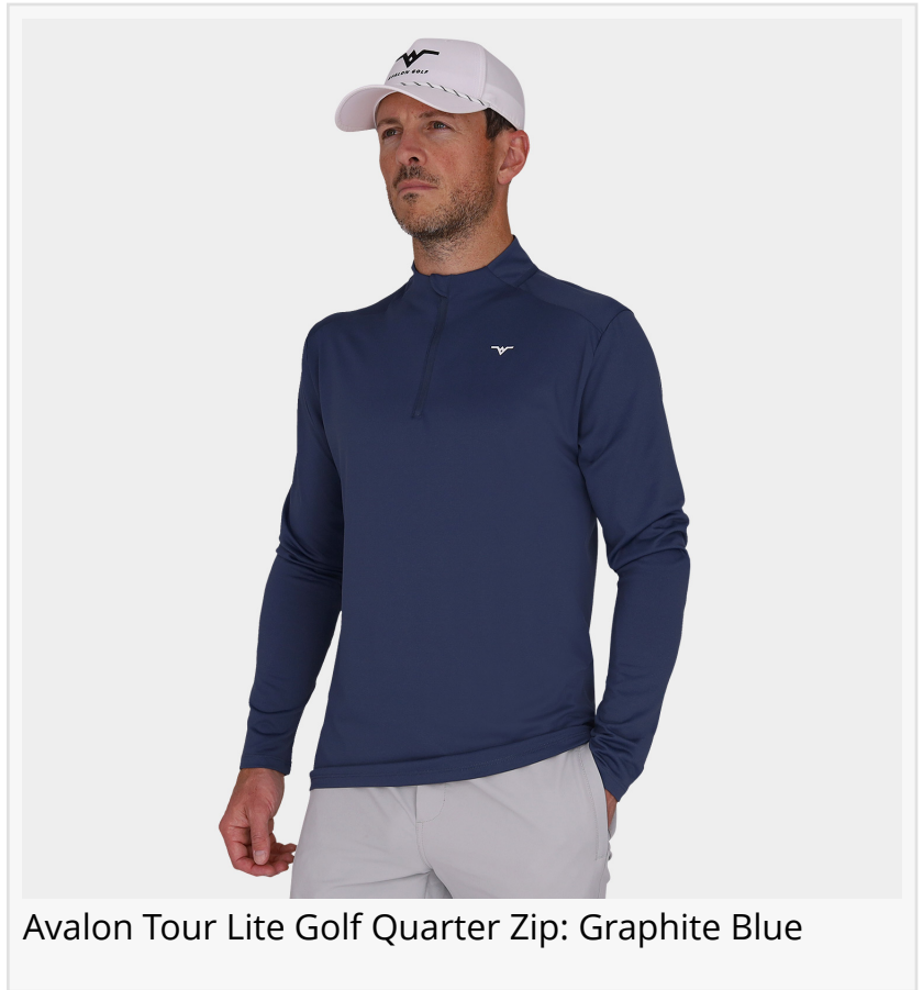
Avalon Tour Lite Golf Quarter Zip: Graphite Blue