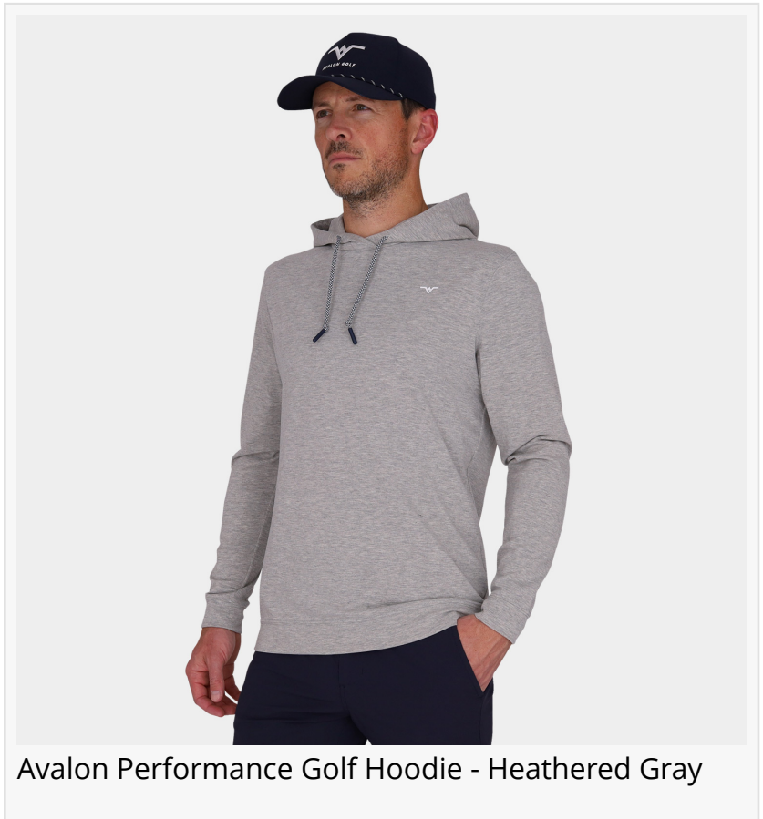
Avalon Performance Golf Hoodie - Heathered Gray

LOS ANGELES, CA, UNITED STATES, January 15, 2025 /EINPresswire.com/ -- Avalon Golf Co, a leading Luxury Men's Golf Apparel, introduces new Golf Layer Tops to their Modern Men's Golf Apparel Collection. The collection features 3 new layer top styles and 21 new SKU's. The new Avalon Golf Tops compliment Avalon's existing line of golf joggers, pants, polos, belts, shorts and accessories and were introduced as functional tops for cooler weather golf rounds. The release includes the Performance Golf Hoodie , Tour Lite Q-Zip and Golf Crewnecks. Each designed with on course intent, these stylish tops are sure to make a style while providing functional warmth and performance.