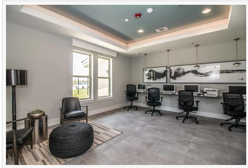
The community business center provides a modern and functional workspace—offering residents the convenience and flexibility to work or study close to home.

Set in the vibrant area of northwest Fort Worth, this community provides a serene suburban lifestyle with convenient access to the heart of the city. Residents enjoy proximity to popular attractions such as Eagle Mountain Lake, offering scenic views, boating, fishing, and outdoor recreation. The neighborhood also boasts a variety of dining, shopping, and entertainment options, creating a