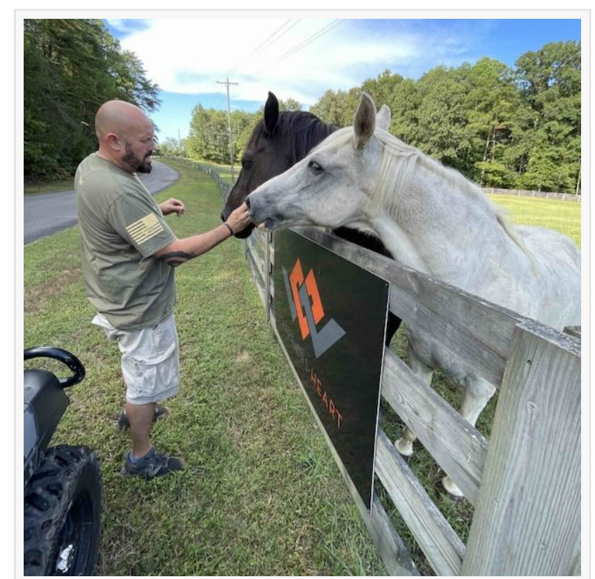
Warriors Heart rehab for veterans, active-duty and first responders adds equine programs to provide new skills for new beginnings in 2025.

At a time when 75% of people give up new year's resolutions by the end of January (<u>CBS News</u>), Warriors Heart's 42-day on-site <u>rehab for veterans</u> helps warriors rebuild their lives with