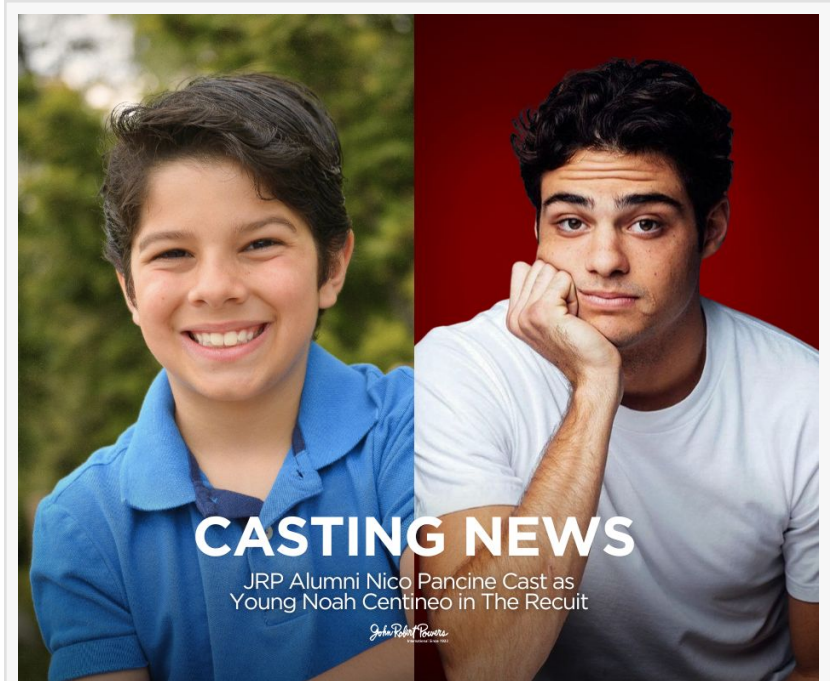
JRP Virtual Alumni Star in Netflix's The Recruit Season 2