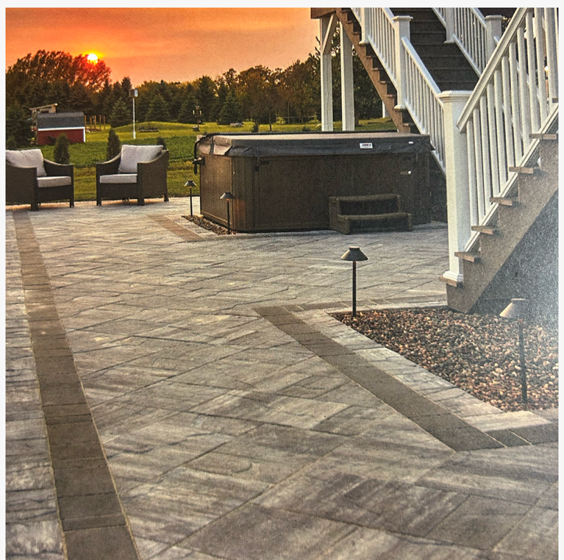
Home Exterior Services by Cutting Edge Property Maintenance

In spring, the team focuses on cleaning debris, aerating soil, and refreshing landscaping beds to prepare for new growth. Summer brings lawn care and irrigation management to combat heat stress, while fall services include leaf removal, pruning, and winterizing plants. This approach ensures that properties remain well-maintained and resilient throughout the year.