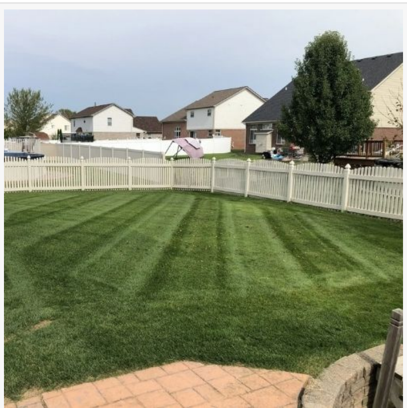
Lawn Maintenance by Cutting Edge Property Maintenance

Winter in Michigan presents significant challenges for property owners, particularly commercial businesses. Snow and ice can disrupt operations and compromise safety. Cutting Edge Property Maintenance provides essential winter services, including snow removal and de-icing, to keep parking lots, walkways, and building entrances clear and accessible.