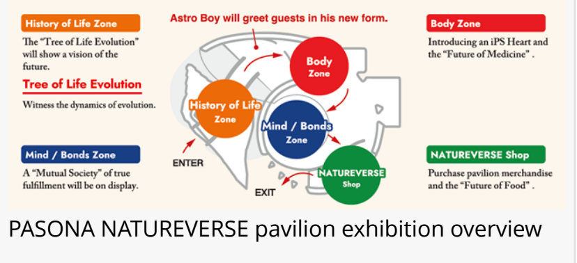
PASONA NATUREVERSE pavilion exhibition overview