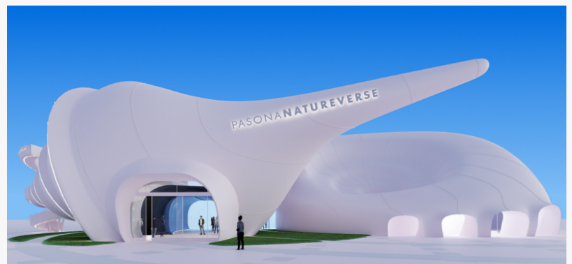
"PASONA NATUREVERSE" exterior concept image