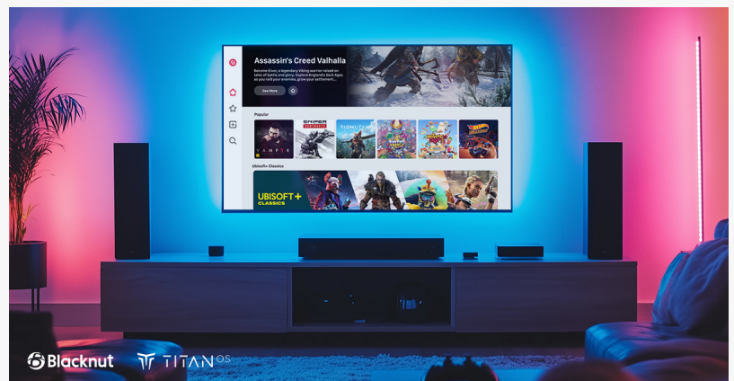
Blacknut TV Set