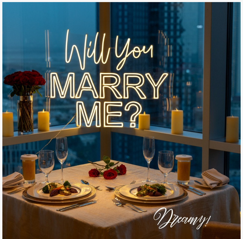
Valentine's Day Proposal In Dubai

1. Burj Khalifa Views : Intimate rooftop settings with panoramic views of the world's tallest building.