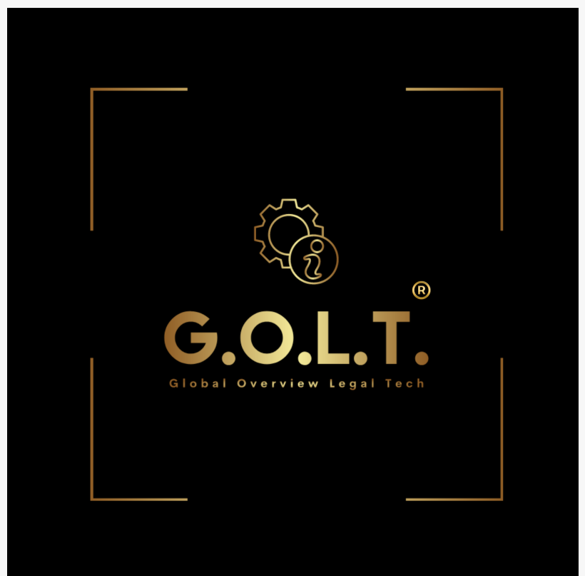
GOLT.ai - one of the world`s largest legal technology directories