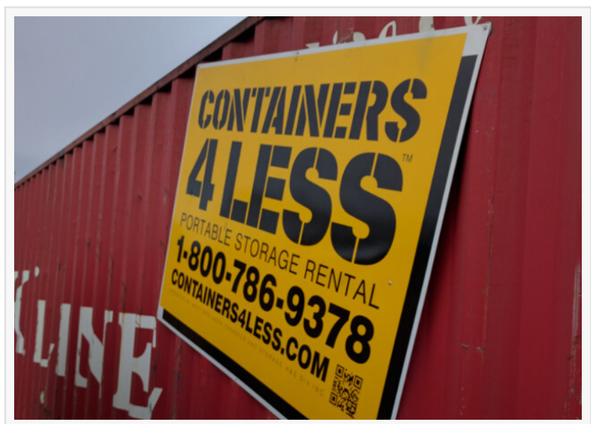
C4Less Truck Exterior

Conex containers, also known as shipping containers, have become the