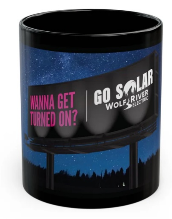
Wolf River Electric Wanna Coffee Mug