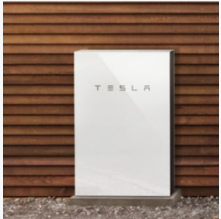
Wolf River Electric Solar Storage

The Wolf River Electric team specializes in designing systems with trusted technologies like Tesla, Enphase, REC, or Moxeon solar panels, offering personalized support to homeowners, businesses, and organizations across the Midwest. Customers searching for a solar panel