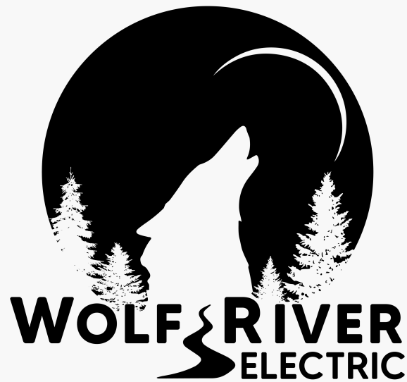
Wolf River Electric Logo

$5,700,000 (excluding roll-over funds from the 2024 program, which will be finalized soon).