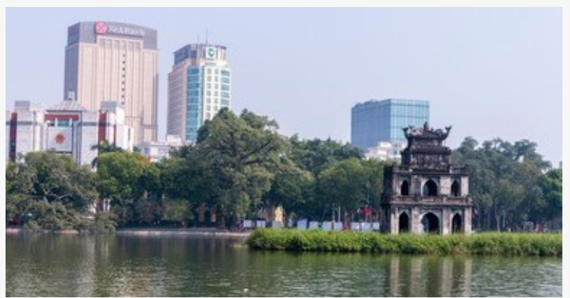
Ha Noi Blends Tradition and Energetic Development

for Americans that engages Vietnam's history, culture, cuisine and current challenges. It offers insights, experiences and people to people meetings unavailable on commercial tours.