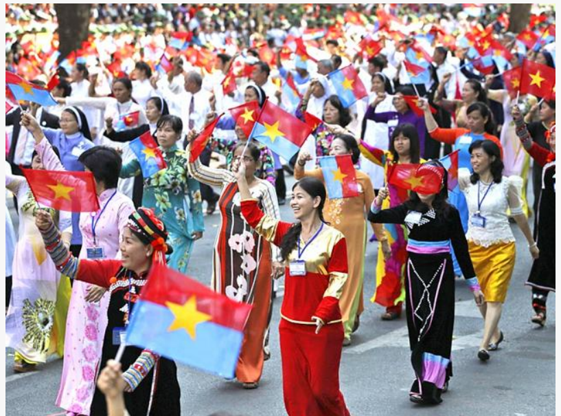
Celebration in Ho Chi Minh City for the 40th anniversary (Covid canceled the 45th)

This press release can be viewed online at: https://www.einpresswire.com/article/777348536