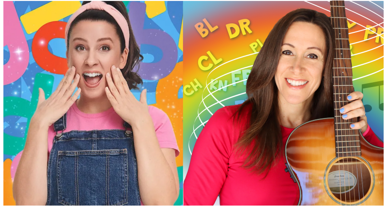
Pioneering Joyful Learning: Ms. Patty Shukla and Ms. Rachel Transform Early Childhood Education Through Music

As digital content continues to transform learning landscapes, two YouTube stars, Patty Shukla and Ms. Rachel, are at the forefront of this evolution, offering children from infancy to kindergarten an engaging way to learn through music. Both creators have harnessed their personal challenges with their non-verbal sons as a catalyst to develop songs that support speech development and early education, thereby making a significant impact in homes and schools worldwide.