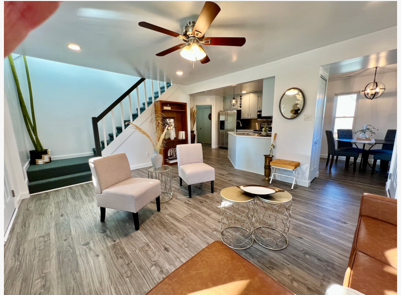
10906 Timonium Dr., Chester, VA 23831