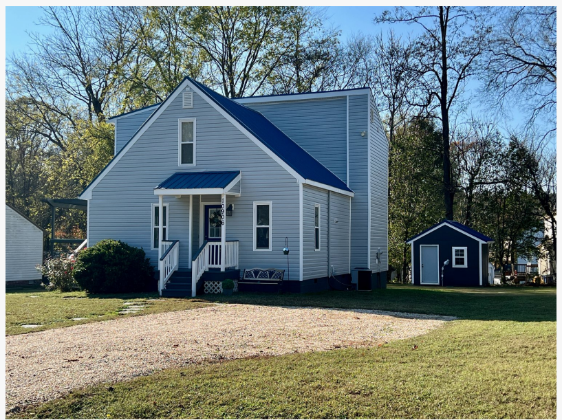
10906 Timonium Dr., Chester, VA 23831