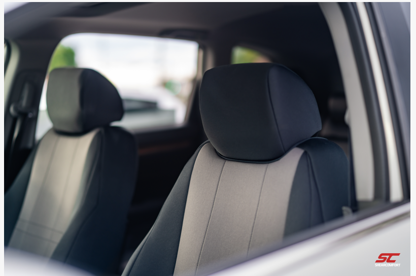
Shear Comfort Seat Covers