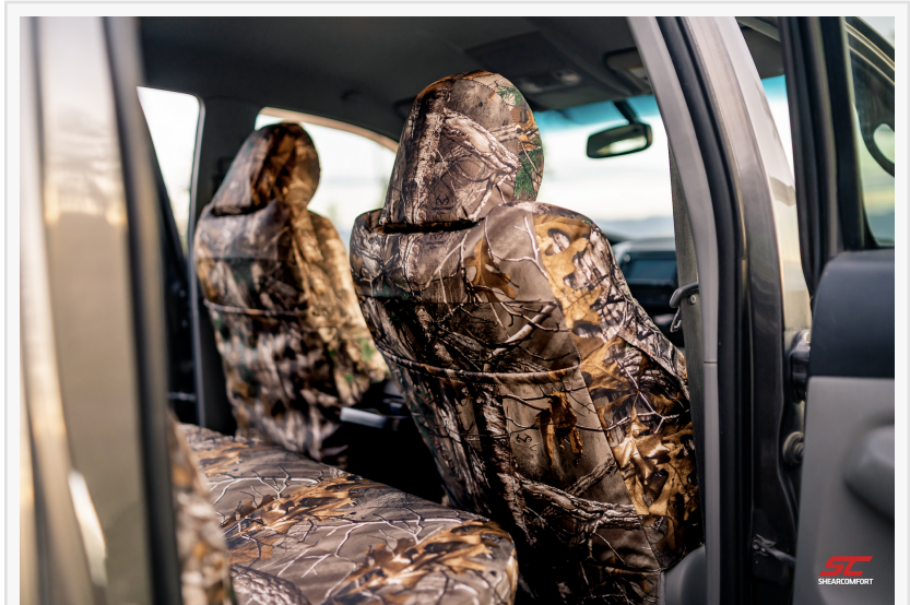
ShearComfort Seat Covers

Customers interested in ShearComfort's new range of truck seat covers can visit ShearComfort's website for detailed information on options available for each model. The company ensures a seamless shopping experience with detailed product descriptions, easy navigation, and