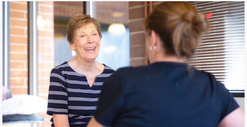
Advanced Spine & Posture