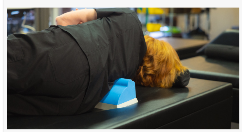
Advanced Spine & Posture | Dennneroll