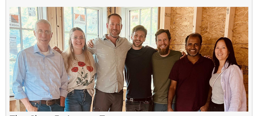
The Clear Estimates Team

After an agent has generated their instant inspection estimate, the quote is aggregated into the RealReport, enriching the report with even more relevant and timely information. Each RealReport is powered by comprehensive property data from over 60 top providers, encompassing permit records, tax history, climate risk, flood insurance costs, liens, zoning details, school scores, utility estimates, U.S. Census data, rental potential, valuations, and more.