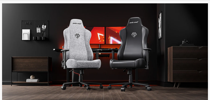
Novis Series 2 Colors

In addition to this exclusive offer, AndaSeat is also providing sitewide discounts, allowing customers to save up to $160. This includes a $30 discount on all products and an additional $20 off the purchase of a Kaiser 3. The combination of these discounts and the bundled deal for the Novis XL gaming chair underscores AndaSeat's commitment to making ergonomic comfort more accessible without compromising on the premium quality that the brand is known for.