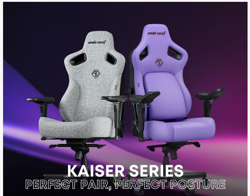
AD Valentines Day AndaSeat 2025 1