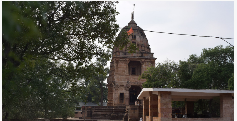
Front view of Gauri Somnath Temple, Omkareshwar