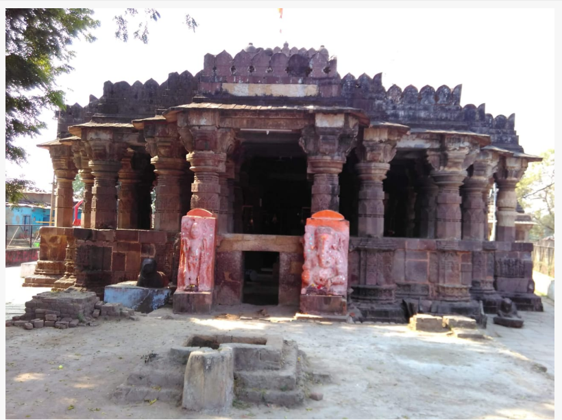
Front view of The Bilpkeshwar Temple

The Shiva Temple, Brijpura, built in the late 12th century CE by Chandela ruler Rahil, is a prime example of medieval Indian architecture. The temple, east-facing and constructed of stone, includes an assembly hall with ornately carved pillars and walls adorned with depictions of