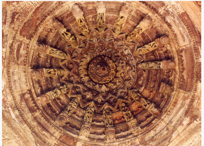
Ceiling of Bilpkeshwar Temple