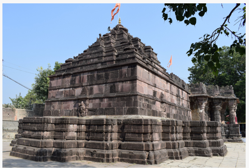
Back view of The Bilpkeshwar Temple

Madhya Pradesh's temples stand as enduring symbols of spiritual devotion and architectural achievement. Each site, with its intricate carvings and historical significance, tells the story of a rich and vibrant past.