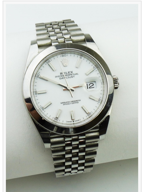
Rolex 41mm Oyster Perpetual Datejust wristwatch M126300-0006. COSC Superlative Chronograph Certified, Rolex Caliber 3235. Rolex box, tags, original sales receipt. Estimate: $8,000-$8,500