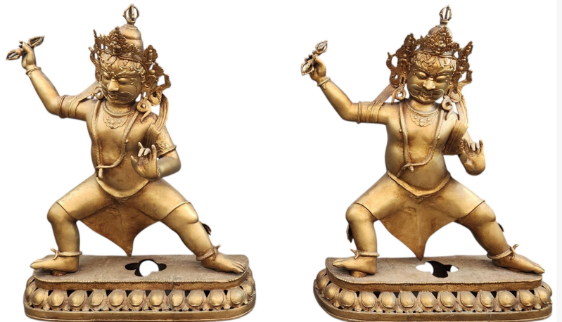
Pair of large 20th-century Nepalese gilt copper figures of Vajrapani (protectors of Buddha) wearing elaborate headpieces and body adornments. Size: 35in x 27½in x 8½in. Lot estimate: $2,000-$4,000