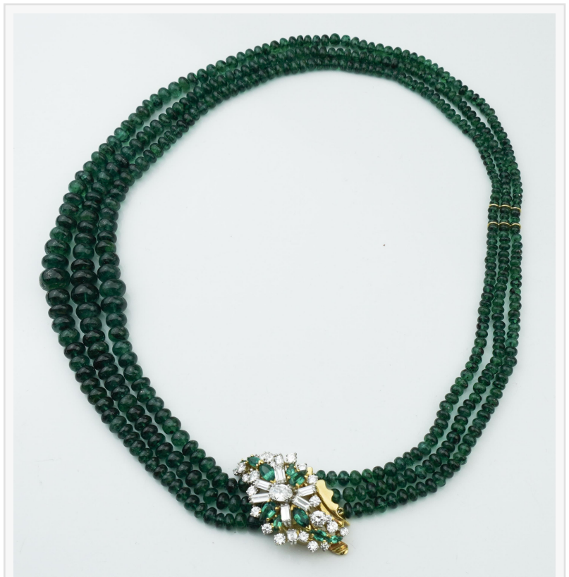
14K yellow gold necklace with approx. 247 cts of cabochon emeralds; 4.57 cttw diamonds. Estimate: $2,500-$3,000

The array of antique furnishings continues with a 19th-century English secretaire bookcase made of mahogany with pine as its secondary wood. Its design elements include a classical open