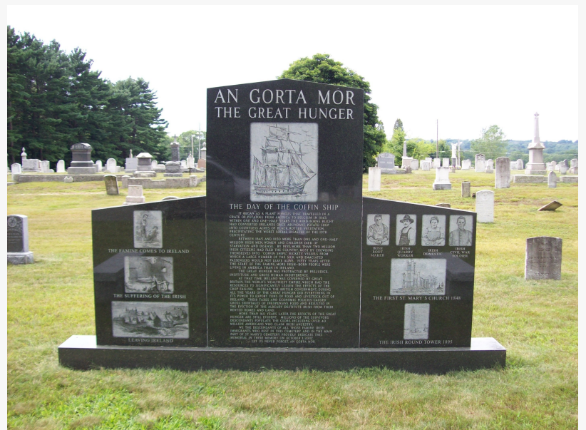
"An Gorta Mor" The Hunger Death