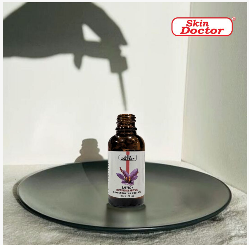
Hassan Najafi Oil