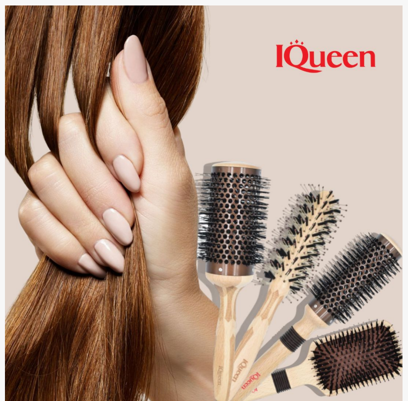
Hassan Najafi Oil

As it celebrates 25 years of success, Hassan Najafi Oil looks toward the future with ambitious