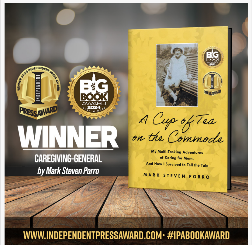
2025 Independent Press Award Winner