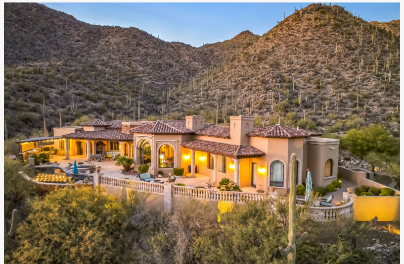
15275 North Silent Vista Court, Marana, Tucson Area, Arizona