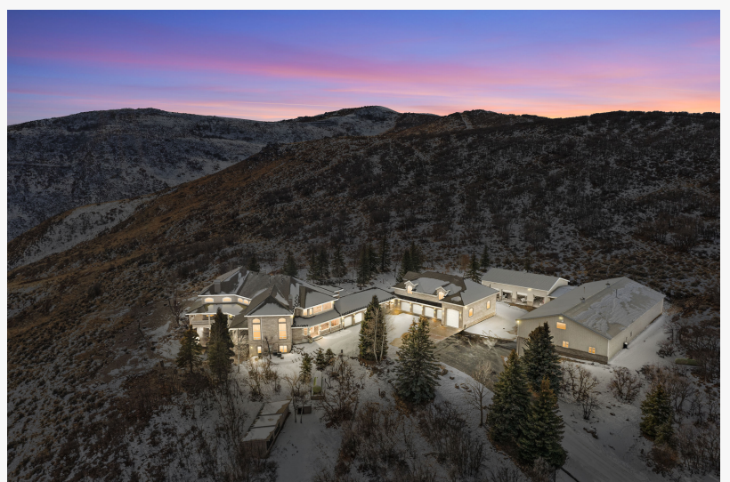
1501 Oak Haven Lane, Wanship, Near Park City, Utah

An extraordinary Mediterranean masterpiece meticulously crafted by Alan Roberts with interiors by Lori Carroll, this architectural marvel celebrates the dramatic Arizona landscape. Perched on one-and-a-half acres, the estate commands panoramic views of soaring saguaros and monumental mountain ranges. Twelve-foot handcrafted metal doors open to an impressive gathering room defined by arched windows and a dramatic fireplace. European-inspired details emerge through Florentine ceiling techniques, cantera stone elements, and exquisite natural stone flooring. A resort-caliber veranda embraces the entire property, transforming outdoor living into an art form. The sparkling pool, spa, fully equipped outdoor kitchen, pizza oven, and fire pit create an unparalleled entertainment environment. Viking professional appliances, a one-thousand bottle wine cellar, and meticulously designed spaces elevate every moment of extraordinary desert living.