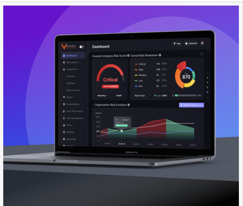
Phoenix Platform V3 risk based vulnerability management with power of contextualization

Gartner Digital Markets is the world’s largest platform for discovering software and services.