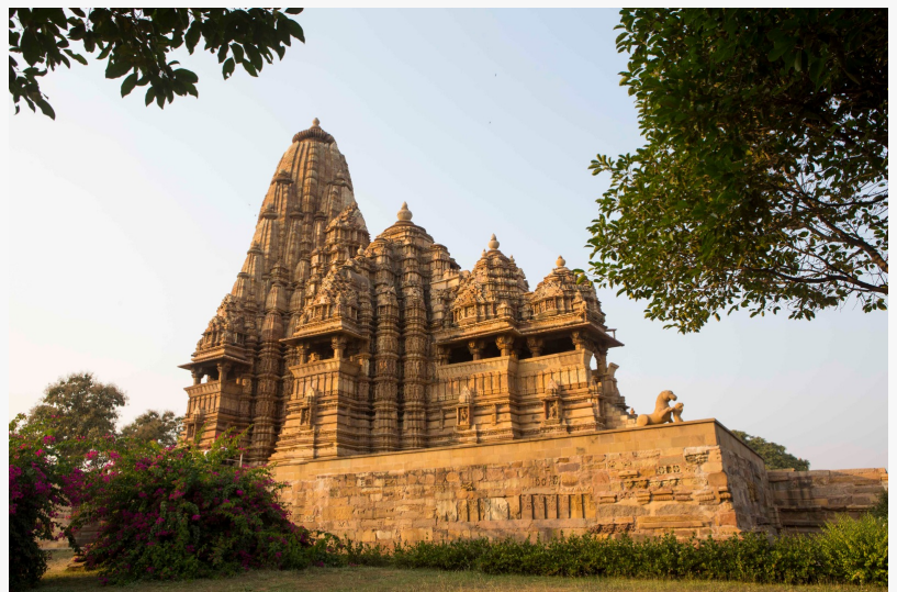
Khajuraho Group of Temples

Additionally, the pavilion will showcase Madhya Pradesh's commitment to sustainable tourism through its acclaimed wildlife reserves, such as Kanha, Bandhavgarh, and Satpura National Parks. These sanctuaries offer rare glimpses of India's rich biodiversity while championing eco-