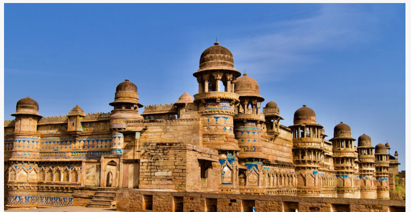
Gwalior Fort in Madhya Pradesh