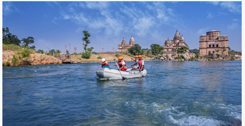
River Rafting - Orchha