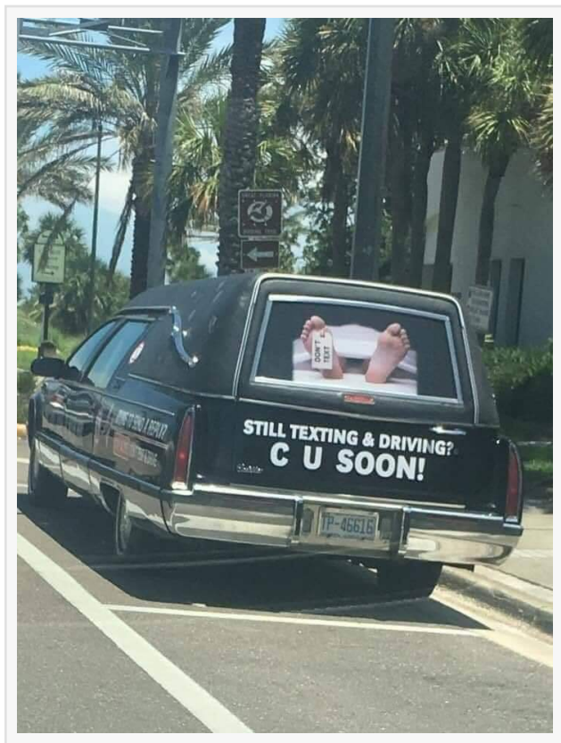
Put the phone away, when the key is in the ignition...PLEASE!

This press release can be viewed online at: https://www.einpresswire.com/article/778467657