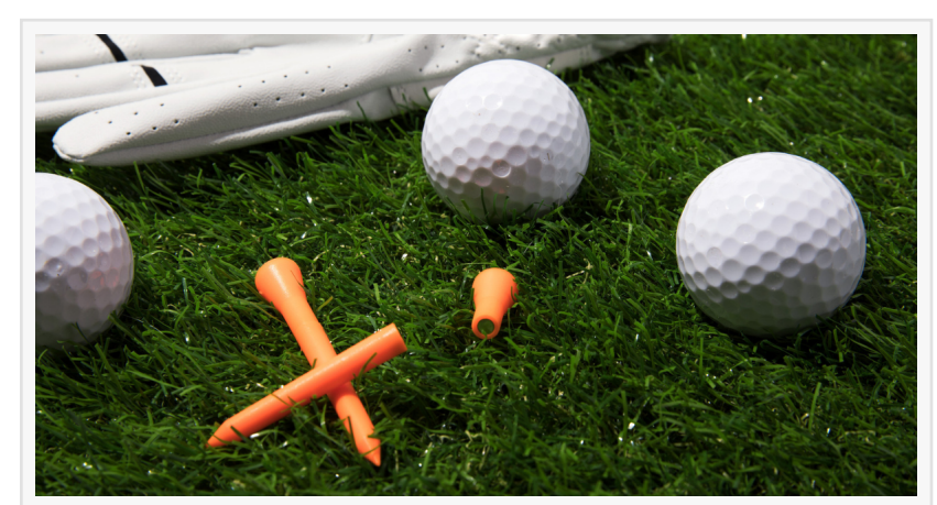
PopTopT's two-piece magnet tee is proven to add up to 7 extra yards

CA, UNITED STATES, January 24, 2025 /EINPresswire.com/ -- PopTopT, a patented two-piece golf tee designed to enhance drive performance, has been recognized with the Seal of Excellence by Golf Test USA. This acknowledgment highlights the tee's innovative approach to reducing friction and spin, leading to measurable improvements in drive distance and accuracy.