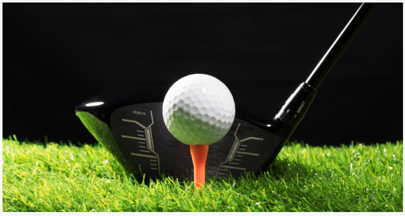
Experience added distance and 15% more accuracy with PopTopT's golf tees

PopTopT tees are PGA-compliant and available in both magnetic and non-magnetic designs, making them suitable for golfers of all skill levels. The product's design reflects a broader effort to innovate even the smallest elements of golf equipment to achieve meaningful improvements on the course.