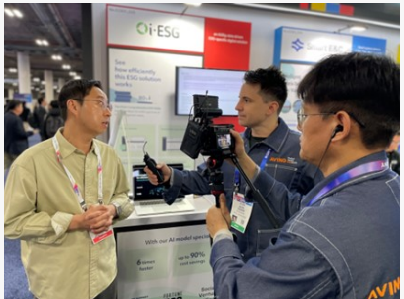
i-ESG's interview with AVING