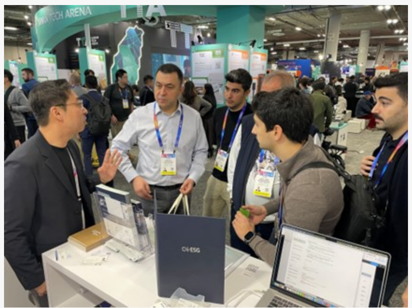
i-ESG showcase ESG SaaS Solution at CES2025

More than a technology showcase, CES2025 marked a significant milestone for i-ESG in expanding its global partnerships. By offering actionable solutions for companies transitioning ESG practices into growth drivers, i-ESG reinforced its role as a trusted partner for businesses worldwide. The signing of a Memorandum of Understanding (MOU) with MUREPA (a climate and carbon data provider) was another testament to i-ESG's commitment to making its vision of a sustainable future a reality.