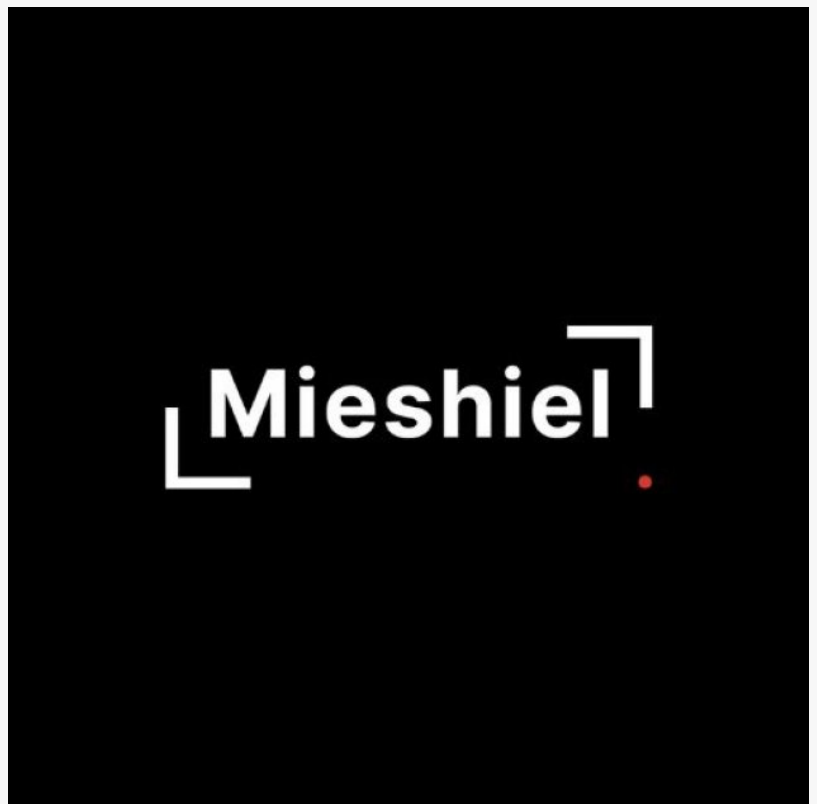
mieshiel paintings -