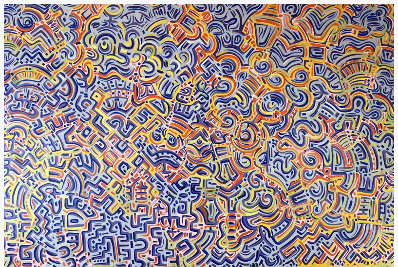
large oil paintings --

The collection showcases Mieshiel's integration of traditional painting techniques with elements of contemporary art. The works balance form and abstraction, providing a variety of interpretations. The paintings address different facets of human experience, with an emphasis on personal reflection and connection. These themes are also explored in Mieshiel's works on