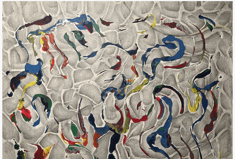
works on paper -