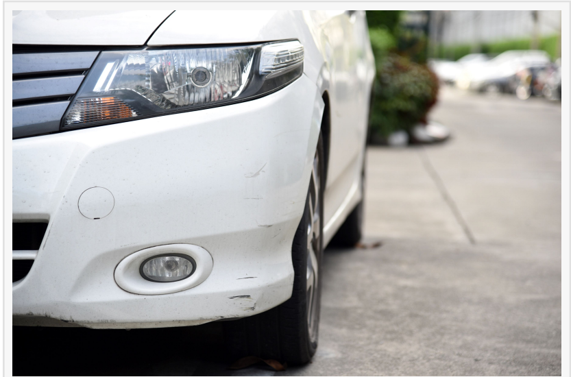
Scratched rental car bumper

This press release can be viewed online at: https://www.einpresswire.com/article/778574669