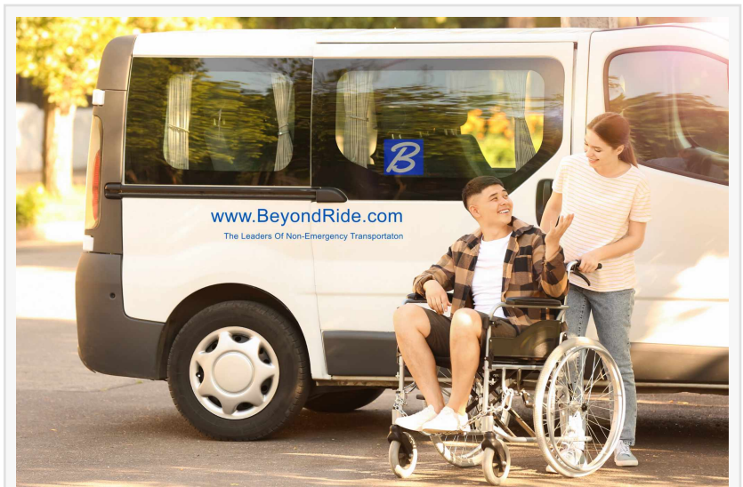
Beyond Ride NEMT VAN Vehicle

Transportation plays a pivotal role in maintaining a high quality of life for seniors, fostering