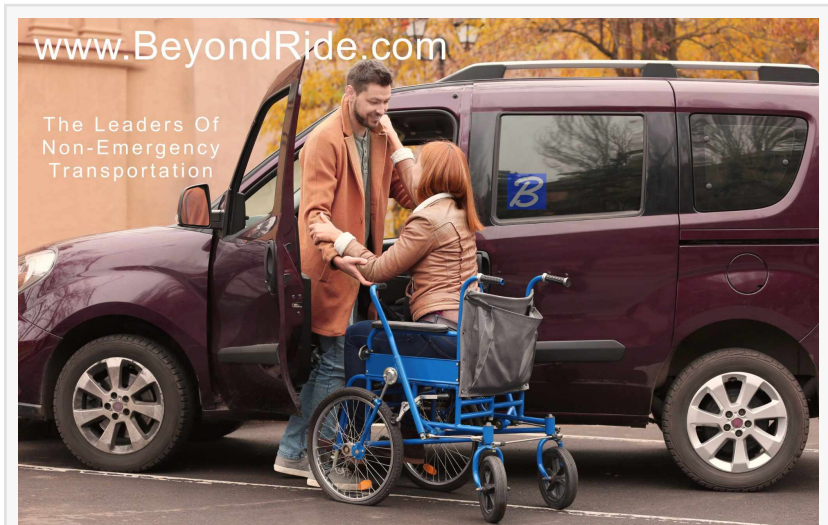
Beyond Ride NEMT VAN Vehicle Another Image

Beyond Ride has stepped in to fill this gap by offering its services as a dependable secondary transportation provider for these facilities. The company's modern fleet and trained drivers are equipped to handle the specific needs of senior passengers, ensuring safe, timely, and